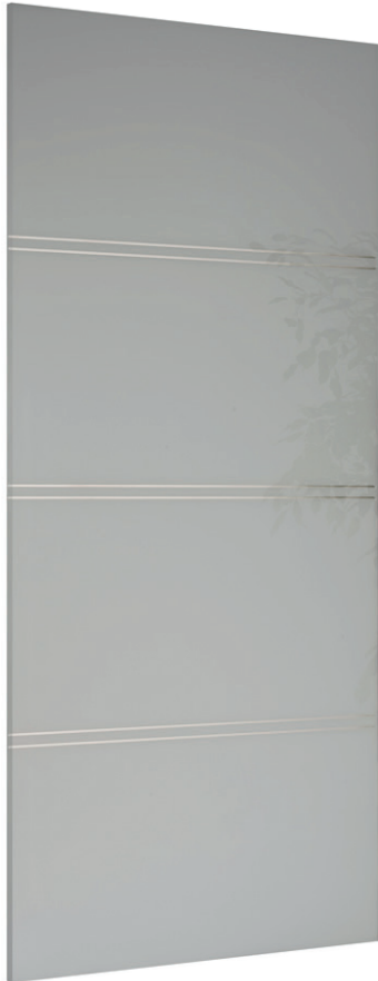
Design 1 RAL 9003

Decorative Glass | Brilliant Cutting Lacquered